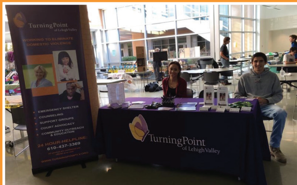
NCC Students volunteering at the Chili Cook-Off at Eyer Middle School