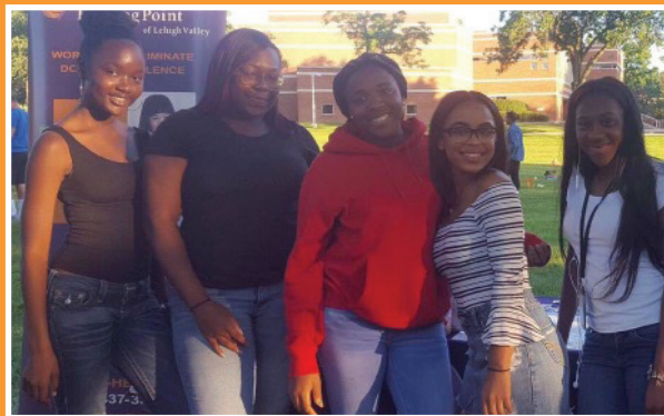
DeSales University Students at It's On Us Campaign