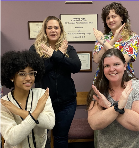
Turning Point's Outreach Team showing solidarity by striking the International Women's Day 2022 pose. #IWD2022 #BreakTheBias

The Women's History Month theme for March 2022 is "Providing Healing, Promoting Hope." This theme recognizes the many ways in which women have provided healing and hope to humanity for countless generations.